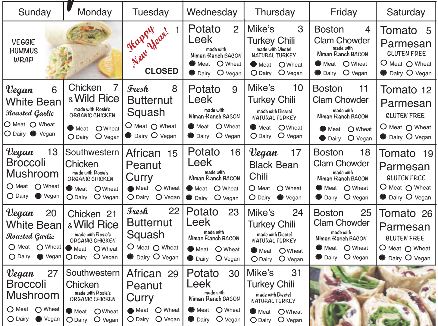
TURKEY-CRANBERRY WRAP WITH DIESTEL TURKEY